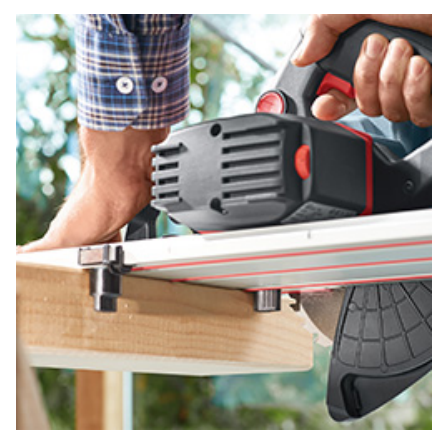
The fixed and adjustable stops on the underside of the rail allow the system to be used for angle cuts from +60^{\circ} to -60^{\circ} .