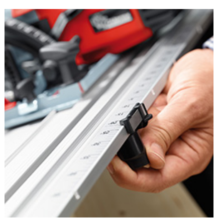
The highly graduated scale permits very precise angle setting.