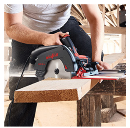
One-stop solution: with the cross-cutting system, the machine is permanently attached to the guide track.