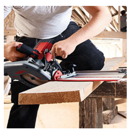
Thanks to the generously-sized angle scale, miter cuts can be realized that ensure a perfect fit.