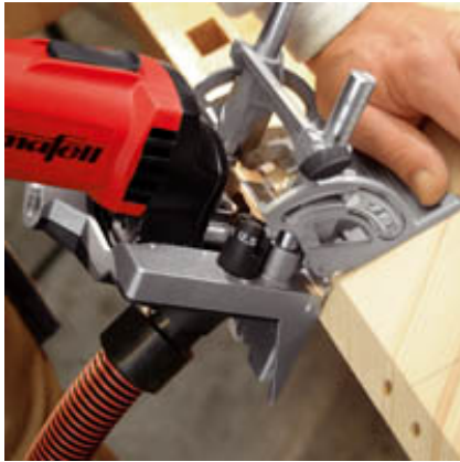
Fast and accurate: Edge-to-edge and mitre corner joints.