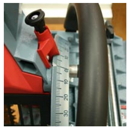
Highly legible scale. Standard tilt angles can be set quickly and simply by means of the locking function.