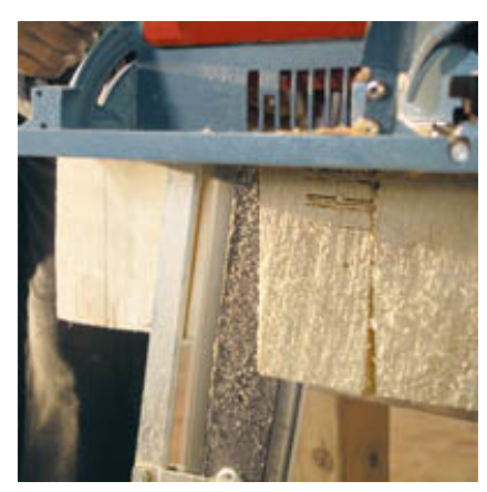
Superior cut quality with the ZSX Ec.