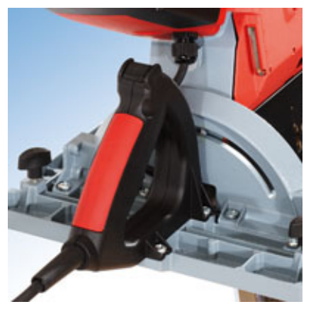
The ideally positioned soft grip handles ensure maximum user comfort. The on/off switch and starting lockout are integrated in the rear handle.