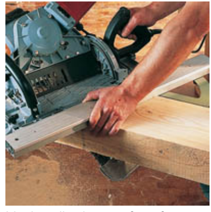
Ideal application e.g. for rafter cuts. The universal guide support as an optional accessory.