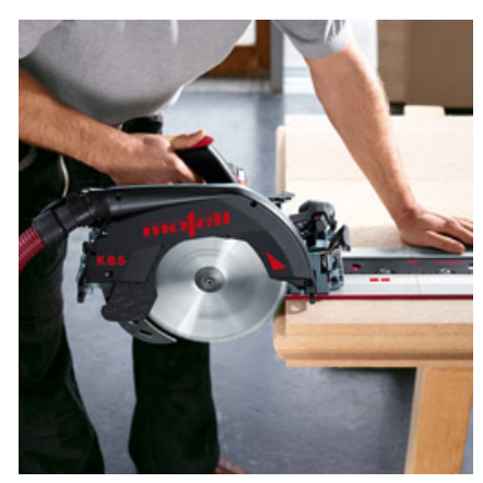
Thanks to the unique tilting system, the sawblade always cuts directly along the rubber lip, irrespective of the angle setting.