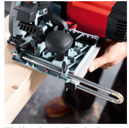
Working close to the edge is facilitated by the K 85-UA roller edge guide. Use the scale marked on the arm to set the spacing.