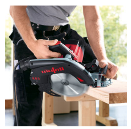
By retracting blade alongside the second handle, offering up the machine is easy and safe, especially when executing bevel cuts.