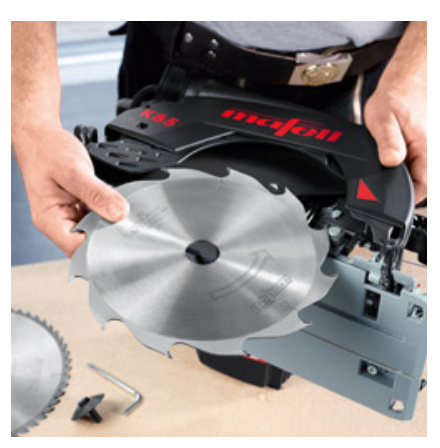
The sawblade and pivoting guard can be locked with a single action. This practical solution engages the starting lockout at the same time.