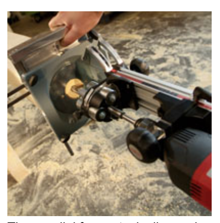
The parallel fence, typically used for end grain drilling, is an ideal accessory to the face edge stop for series production purposes.