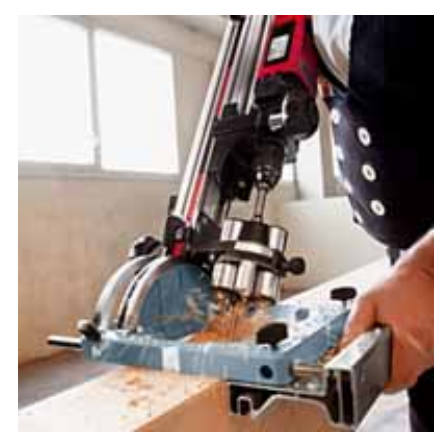
The S models can be precisely set to \pm 45^{\circ} .