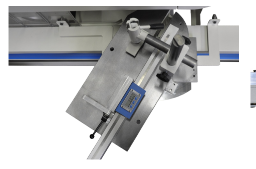
The table can be swivelled 60° in two directions. The working area of the table changes not in shape.

The Pentho Compact 4 has a noise-reduced cut-off saw, tenon heads and two vertical spindles. The machine has a solid table on a stable vertical slide bar. The depth capacity of the machine is 150 mm. The table can be swivelled totally 60° in two directions. The machine has a dust rejecting transparent safety-screen that moves together with the table and covers the machine completely.