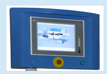
15" touch panel with separate control console