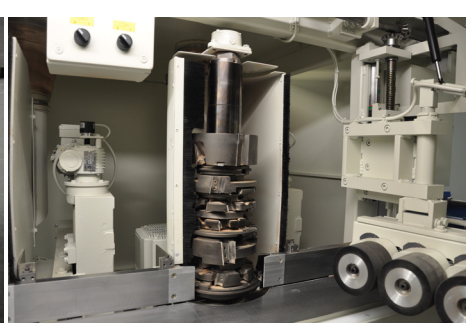
On the shaft(s) different tools can be installed