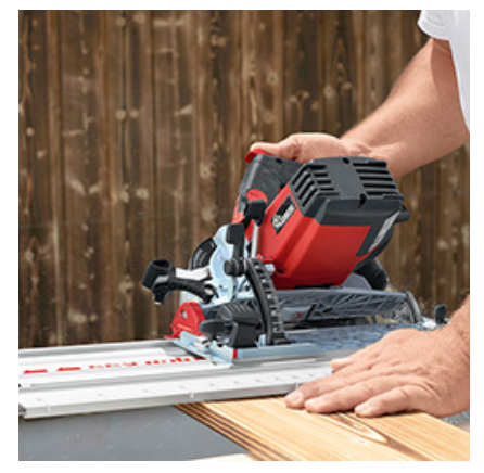
Thanks to the generously-sized angle scale, miter cuts always ensure a perfect fit – as seen here with exterior cladding.