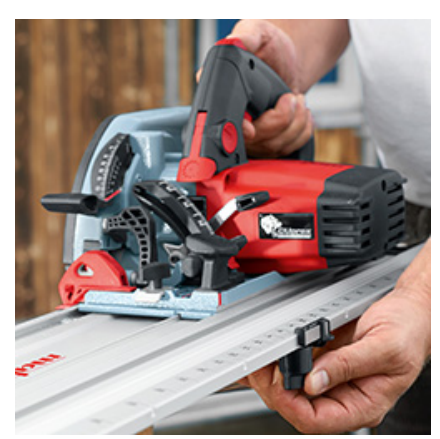
The highly graduated scale permits very precise angle setting.