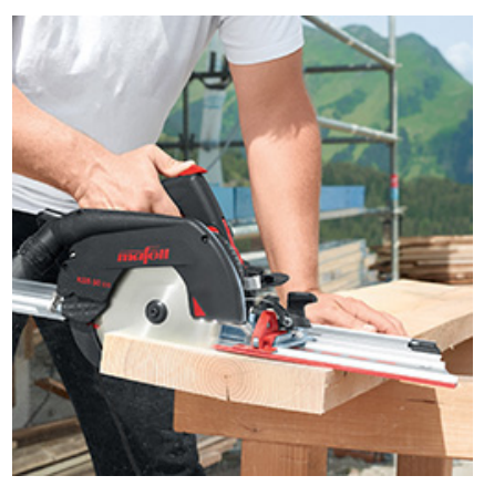
One-stop solution: with the cross-cutting system, the machine is permanently attached to the guide track.