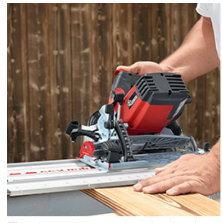
Thanks to the generously-sized angle scale, miter cuts always ensure a perfect fit – as seen here with exterior cladding.