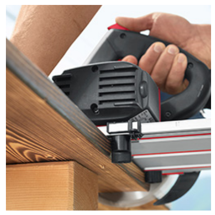
The fixed and adjustable stops on the underside of the rail allow the system to be used for angle cuts from +60° to -60°.