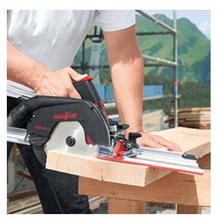
One-stop solution: with the cross-cutting system, the machine is permanently attached to the guide track.