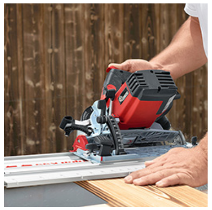
Thanks to the generously-sized angle scale, miter cuts always ensure a perfect fit – as seen here with exterior cladding.