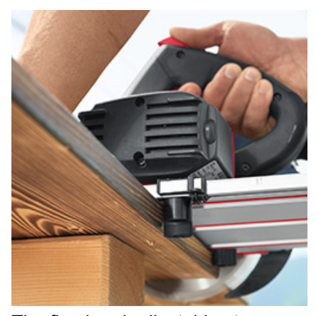
The fixed and adjustable stops on the underside of the rail allow the system to be used for angle cuts from +60° to -60°.