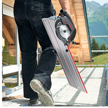
In view of their low weight, the 18 V versions are perfect companions when working on site. The innovative, high-capacity battery technology delivers stamina and tremendous power.