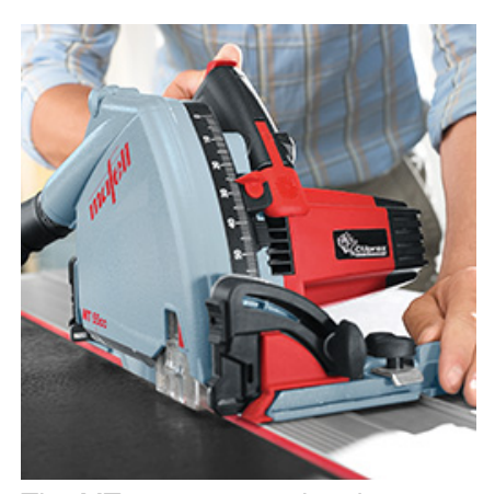
The MT 55 cc comes into its own, for example, when executing high-precision plunge cuts in kitchen worktops.