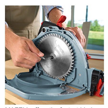
MAFELL offers the fastest blade change worldwide. Simply press release button and lift lever. Housing opens and allows you to change the blade in a matter of seconds, without any risk of damaging the teeth.