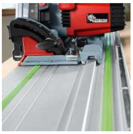
The saw is easy to use on other track systems as well.