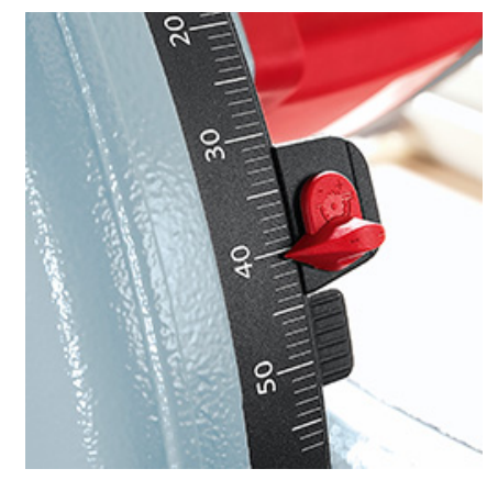
With or without rail – simply turn the pointer to show the exact cutting depth.