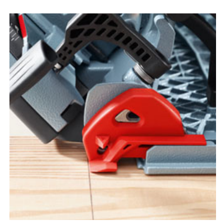
The innovative pointer automatically follows the machine as it is tilted and therefore always accurately tracks the actual cutting edge.