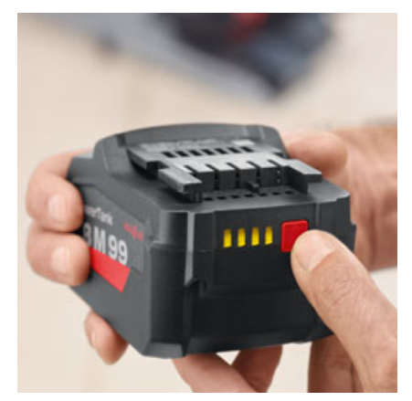
Always in the picture: the battery charge can be checked at any time by pressing a button.