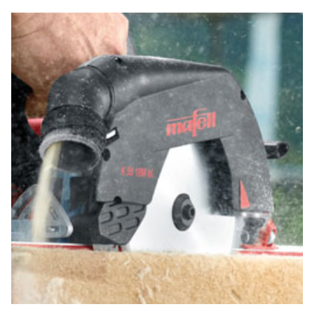
The chips are carried away so efficiently that the vacuum channel cannot become blocked. Users enjoy this crucial benefit when executing plunge cuts in the direction of the fibers as well.