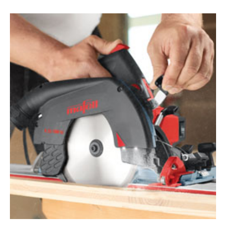
Dispensing with a detachable riving knife, the FLIPPKEIL permits reliable, convenient and straightforward plunge cutting.