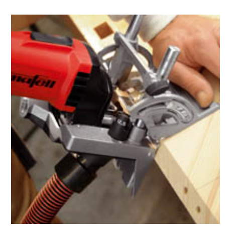
Fast and accurate: Edge-to-edge and mitre corner joints.