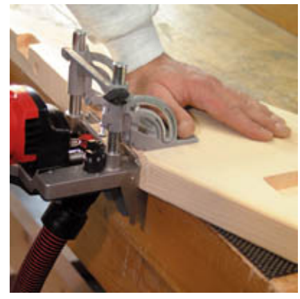
For use in staircase construction, in the workshop and on site.