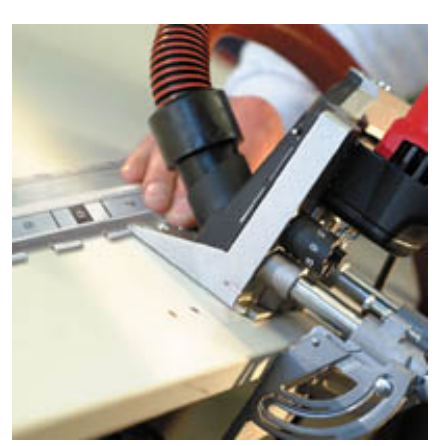
Quick and economical: Making carcasses with the DD40 and dowel template.