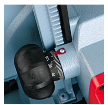
The cutting depth can be adjusted easily via a precise handwheel.