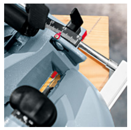
The constant cut display.