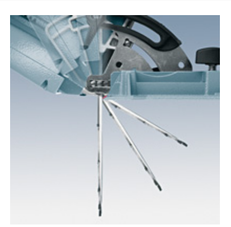
The tilt range of 0^{\circ} - 60^{\circ} enables extreme bevel cuts.