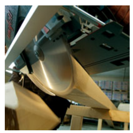
Top results, as shown here with the MKS 165 Ec, can only be achieved with original MAFELL tools.