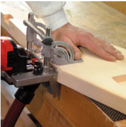
For use in staircase construction, in the workshop and on site.