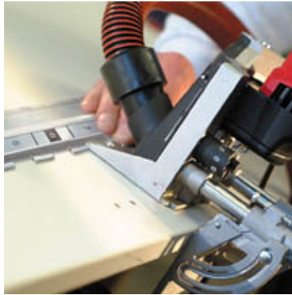
Quick and economical: Making carcasses with the DD40 and dowel template.