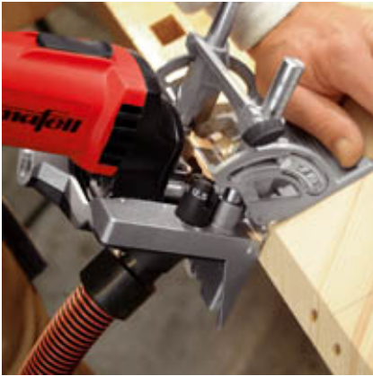
Fast and accurate: Edge-to-edge and mitre corner joints.