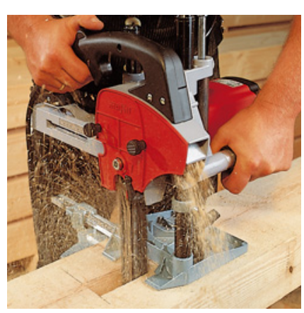
The LS 103 Ec with the guide support stand FG 150 for mortising depths of up to 140 mm.