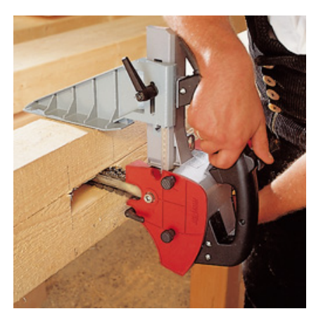
The LS 103 Ec being operated horizontally.