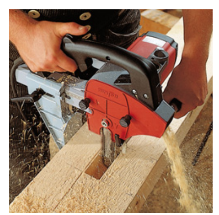
Tenon cuts of various sizes up to 100 mm (3 15/16 in.) with the LS 103 Ec.