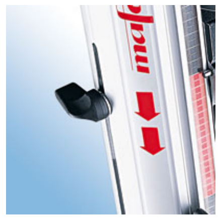
The tensile force exerted by the polyethylene cable can be individually adjusted.