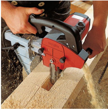
Tenon cuts of various sizes up to 100 mm (3 15/16 in.) with the LS 103 Ec.