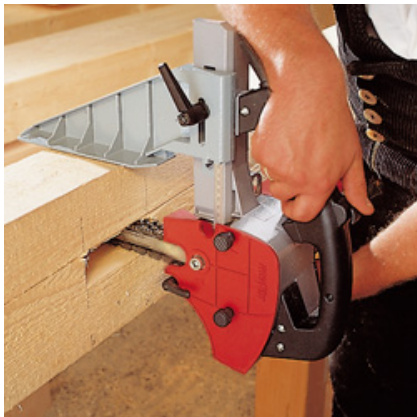
The LS 103 Ec being operated horizontally.