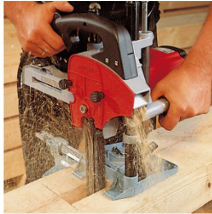
The LS 103 Ec with the guide support stand FG 150 for mortising depths of up to 140 mm.