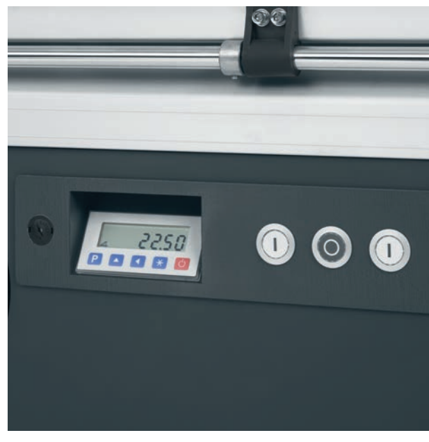
Height and tilt displayed digitally on an LCD monitor.