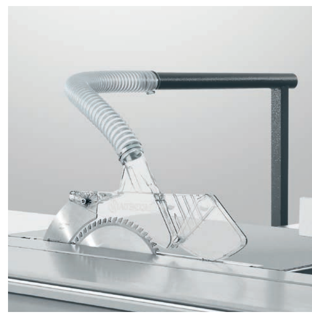
Occupational health and safety is very important to Altendorf. That's why we offer two systems for covering and extracting the saw blade. There is a small safety hood on the riving knife as standard, which allows a clear view of the cutting process thanks to its compact size. An optional large hood is also available, which adjusts to any material thickness and is self-locking.