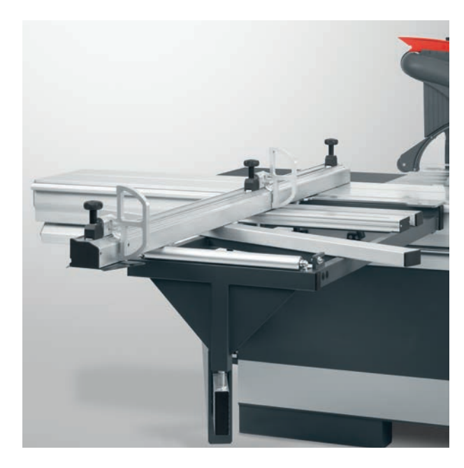
The crosscut-mitre fence simplifies crosscuts and mitre cuts because it does both.