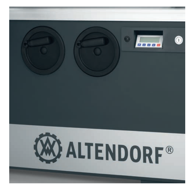
The height and tilt can be adjusted easily using two fold-out hand cranks.