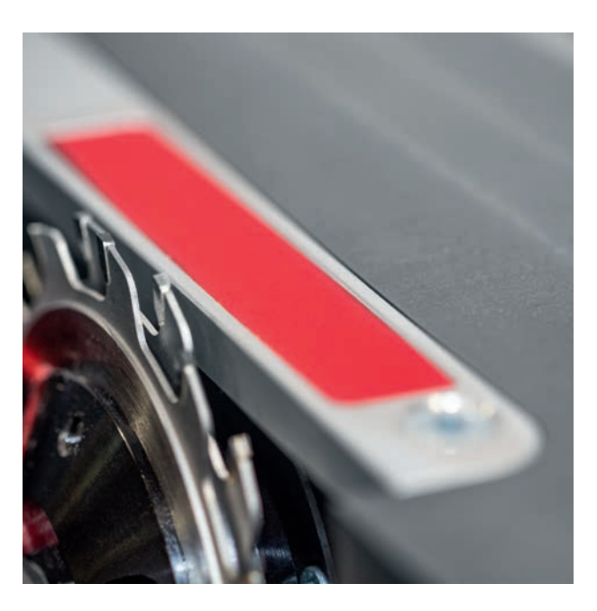
LED illumination near the scorer unit provides more safety for work with the scorer.