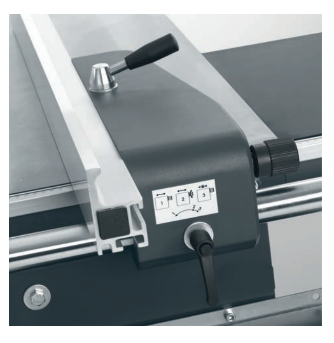
Rip fence with precise manual adjustment.

The Altendorf F25 does everything a sliding table saw needs to do in very little space – all with characteristic Altendorf quality. Whether it's in your first own workshop, for everyday use in industrial manufacturing or as a high-performance second machine – the F25 does it all while saving space, making it all the more productive. Materials such as wood-board materials, solid wood, wood-like materials or extruded profiles can be easily processed thanks to the best precision, simple handling and excellent cutting quality. The saw aggregate, which can be tilted on one side, also makes angular cuts possible. The smooth-running sliding table is based on the Altendorf system and like the digital height and tilt display, is part of the standard design. A machine for beginners and pros alike.